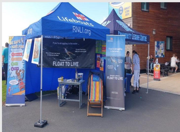
Girvan Harbour Gala