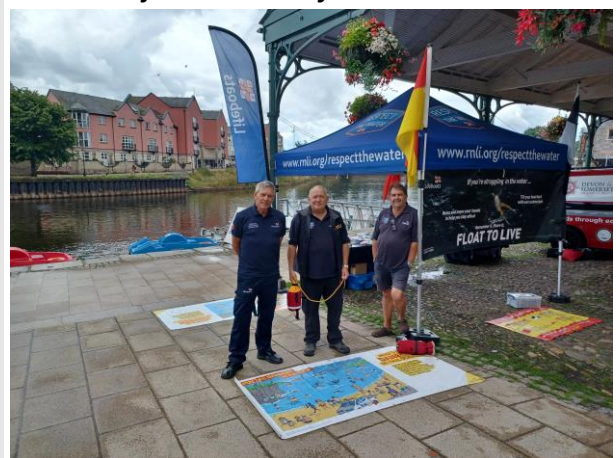
World Drowning Prevention Day on 25 th July in Exeter Quay