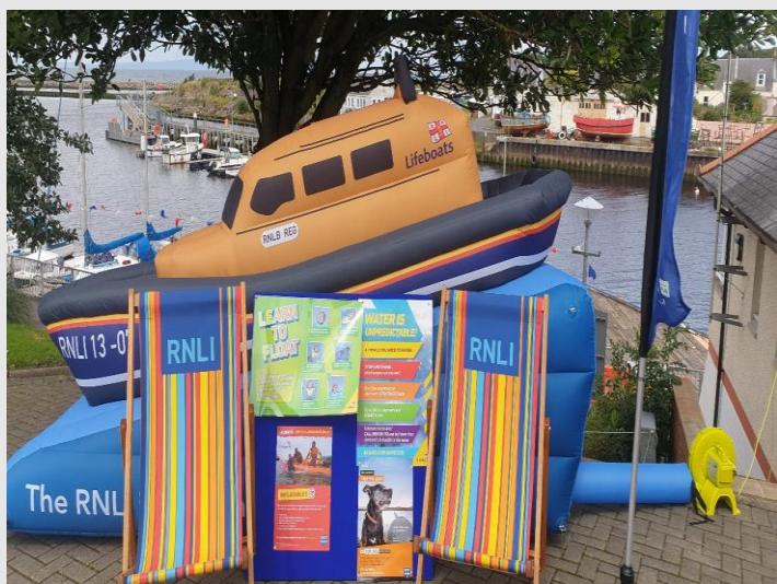
Girvan Lifeboat Station Open Day

people (mostly families), focusing on the important 'Float' message (photo below). It is promising that nearly all the young people spoken to said they could float and had recently been taught how to. Additionally, David facilitated our involvement at the popular Girvan Harbour Gala (photo below) which drew in locals and visitors enjoying holidays in the Girvan area. David took this opportunity to focus on key information around the dangers of improper use of inflatables and the 'in an emergency' messaging, using resources such as the 'Spot the Dangers' posters to illustrate beach and harbour related risks, whilst underlining safer behaviours that allow families to enjoy a safe day out. A total of 314 engagements were recorded at the Gala alone, which is a fantastic commitment to keeping communities safe and well-informed.