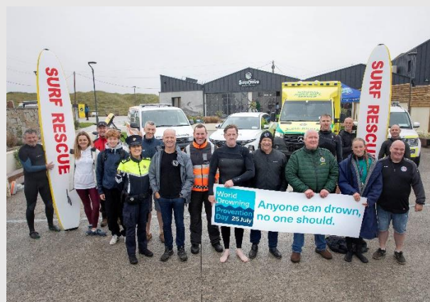
Opening of a National Surf Centre in Co. Sligo

World Drowning Prevention Day: The wet day didn't dampen our spirits or efforts on World Drowning Prevention Day. Here are some snaps from some of the brilliant work done by our volunteers to highlight the day. We managed to deliver joint water safety statements on the day with the Irish Coast Guard and Water Safety Ireland and with HM Coastguard in Northern Ireland. We also got a primetime slot along with Water Safety Ireland to talk about the objective of the day and deliver water safety advice on national radio with a listenership of over 170,000.