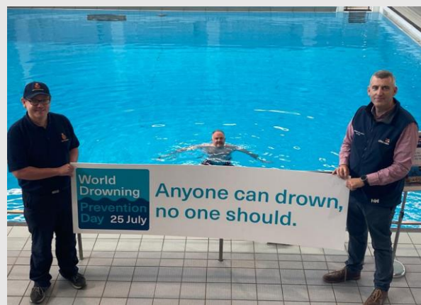
RNLI 'Float' Fundraiser supported by Water Safety Teams from the RNLI and HMCG in Belfast