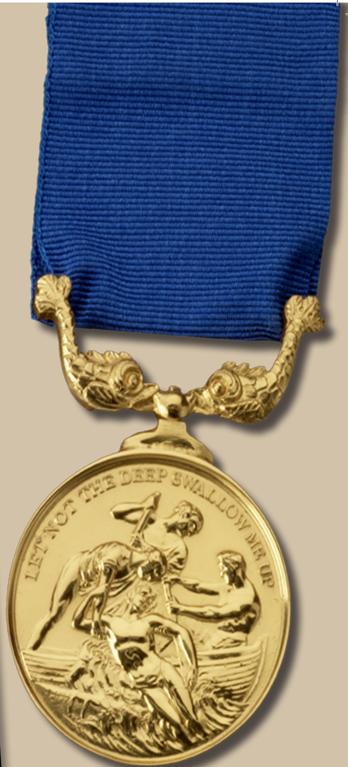
Sir William Hillary's Gold Medal, awarded 1825