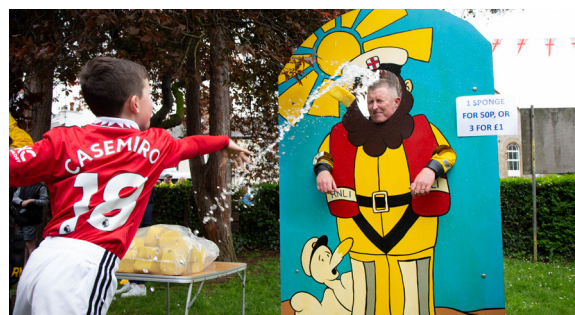
Organise an RNLI Weekend Deliver a programme of activity for the whole family over a few days