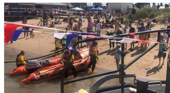
Organise an Open Day Open your doors to the public with food, stalls, and lots of entertainment

Ask your Designated Events Volunteer to register your event online