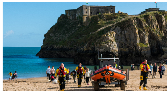
Organise a Meet and Greet Day An opportunity to meet the crew and see the lifeboat in action

RNLI Open Days, Flag Days and Lifeboat Days are annual one crew events for the whole community.