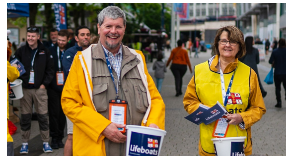
Organise a Flag Day Amplify a street collection into an annual Flag Day in your city, town or village